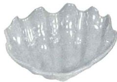
T9 7" SHELL BOWL