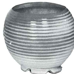
70-B—5½" RINGED JARDINIERE