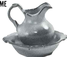
40AB—PITCHER & BOWL SET