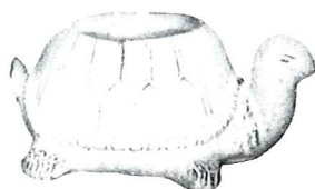
396—7" TURTLE PLANTER