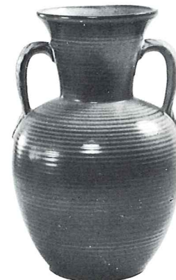
71—10" LEAF HANDLED VASE