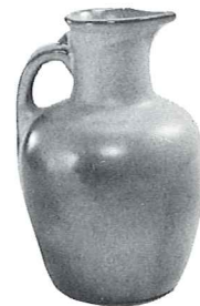
8—24 OZ. PITCHER