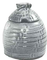
803—HONEY JAR W/LID