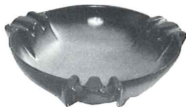
458—7" THREE SIDED