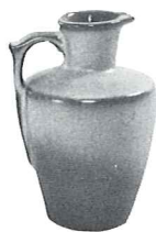
838—10 OZ. PITCHER