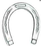
*167—3½" MINIATURE HORSESHOE

Items below not available in Terra Cotta * Except where noted