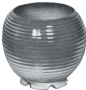
70-A—7" RINGED JARDINIERE