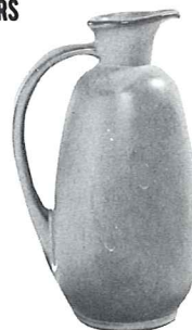
835—24 OZ. PITCHER