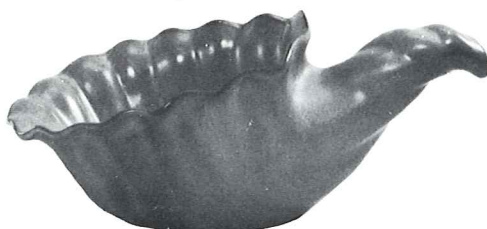
222—12" CORNUCOPIA (Not Available in Flame)