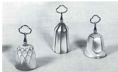
817—6" TABLE BELL 815—7" TABLE BELL 814—6" TABLE BELL

MINIATURES: Appropriate for Pin Trays, Nut Cups, Ash Trays, etc.