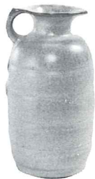
831—16 OZ. PITCHER