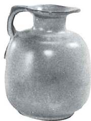
833—24 OZ. PITCHER