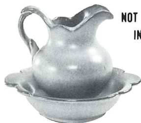
F30AB—PITCHER & BOWL SET