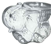
390—6" ELEPHANT PLANTER 5.50