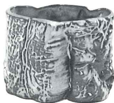
B3—4½" CORK BARK PLANTER