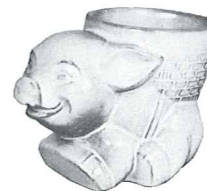
391—6" PIG PLANTER